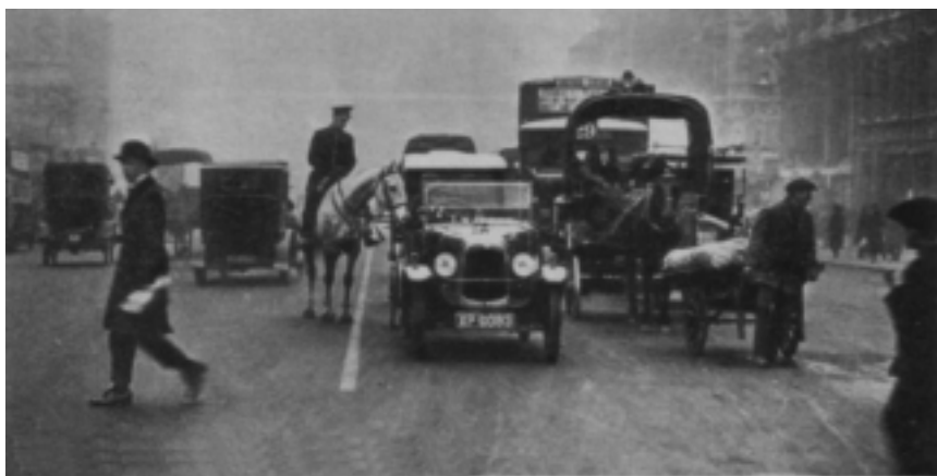
Figure 1. First white line in London.

'pollution' from horse-drawn traffic would leave London knee-deep in the consequences.